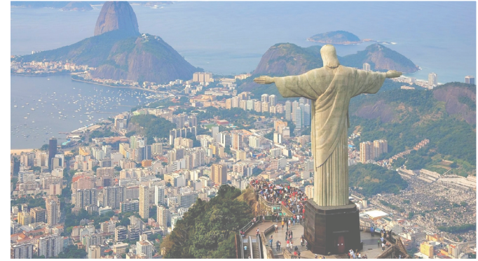
The “Christ the Redeemer” statue is one of Brazil’s most famous landmarks. However, it overlooks a country that is more than 64% Catholic.

Unlike African-Americans who were influenced by Christianity in America, the Catholic church encouraged African-Brazilians to merge some practices of African spiritism with Catholicism.